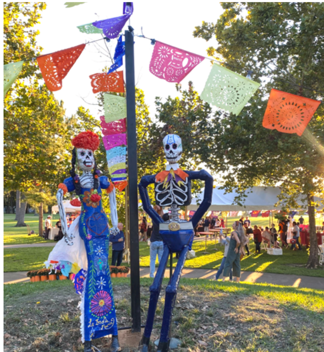
Art by Gabby's mom at our neighborhood Dia de Muertos Festival

We are lucky to live close to so much that Houston has to offer. We walk and bike to our neighborhood parks, pool, library, and favorite breakfast taco spot. We are active members of our local civic club . Your child would grow up a part of a diverse, thriving community .