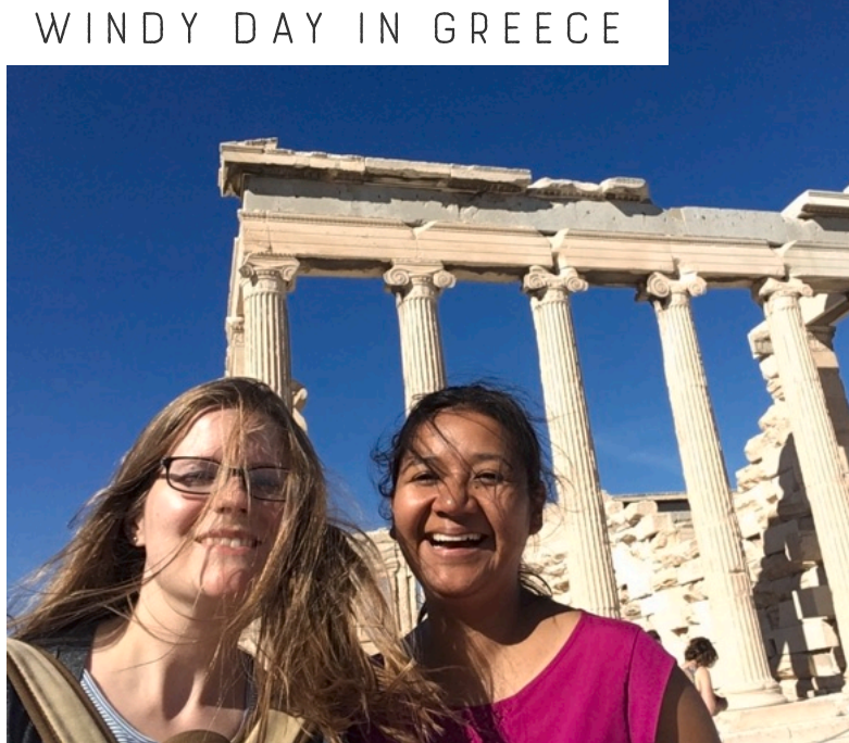
WINDY DAY IN GREECE

We love to see new places, try new foods, and enjoy time away. We would continue these adventures and show your baby what a wonderful world we live in.