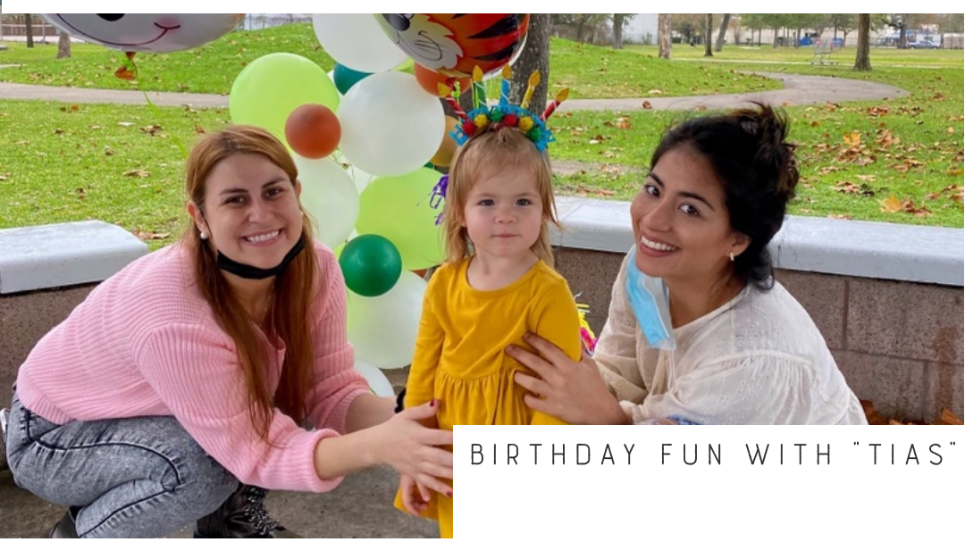
BIRTHDAY FUN WITH "TIAS"