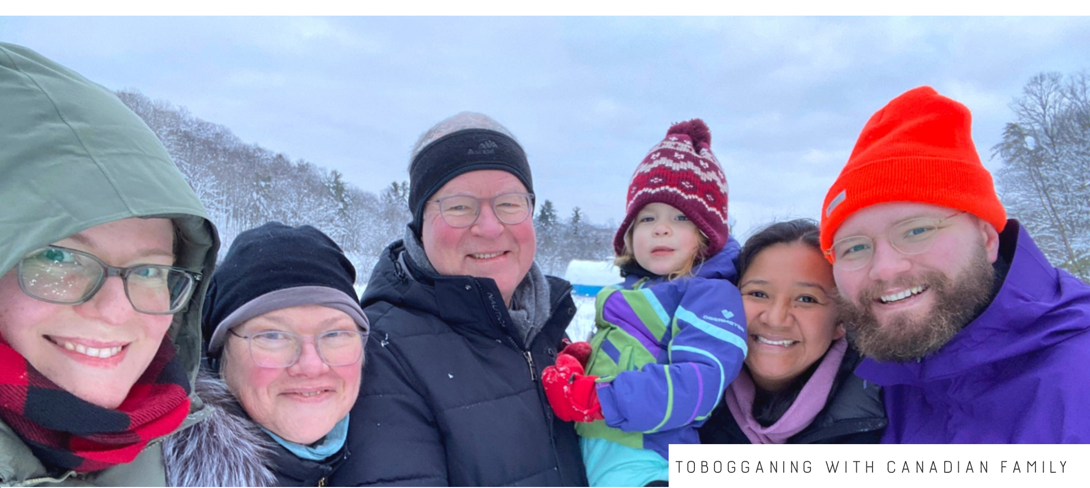
TOBOGGANING WITH CANADIAN FAMILY