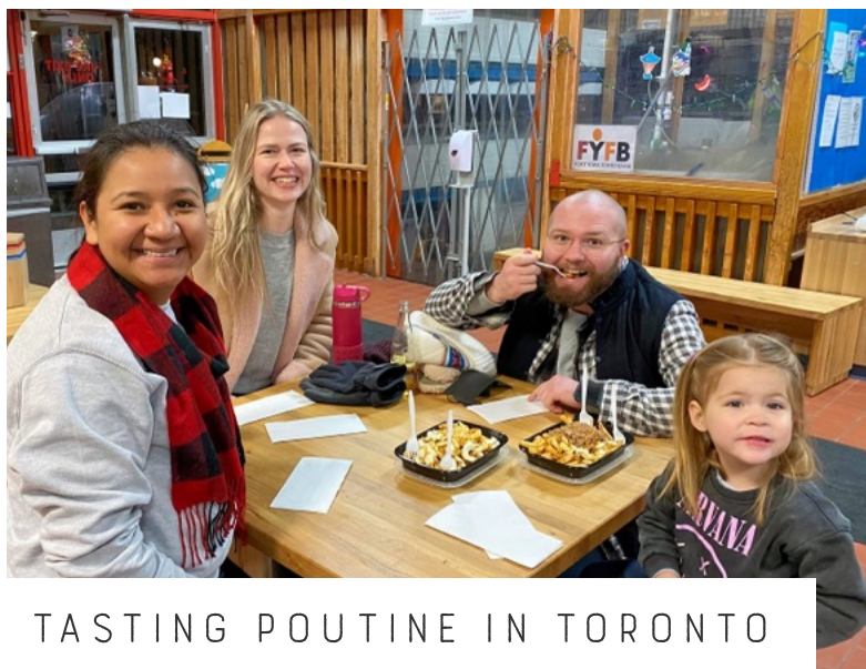
TASTING POUTINE IN TORONTO

We love to see new places, try new foods, and enjoy time away. We would continue these adventures and show your baby what a wonderful world we live in.