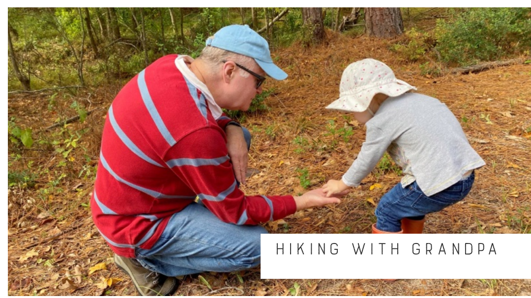
HIKING WITH GRANDPA