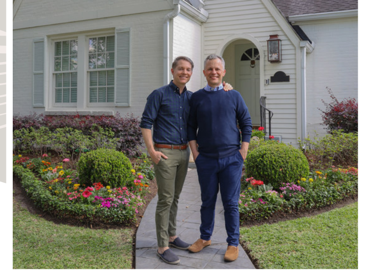
We cannot wait to raise a child in our home.